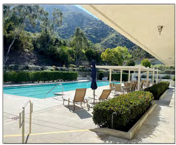
New pergola in pool area by Malisa Kundin (see related story/pics on page 2)