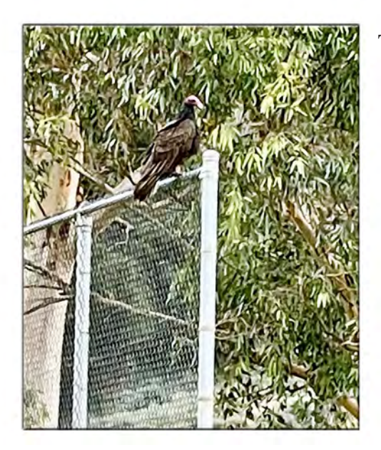
Turkey vulture